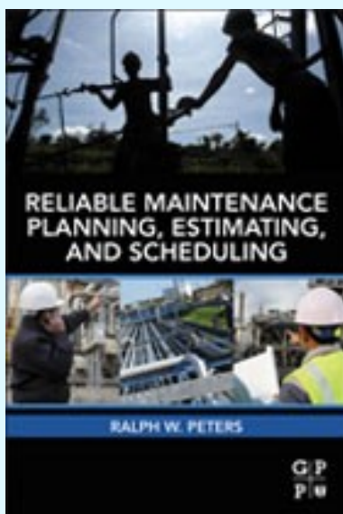
Reliable Maintenance Planning, Estimating and Scheduling